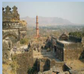
Deogiri Fort - 16 km