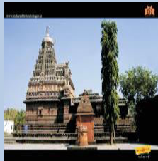
Ellora Caves & Grishneshwar Temple (Jyotirling) 29 km