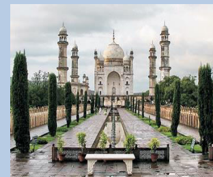
Bibi ka Maqbara - 7 km