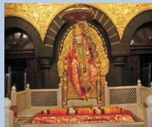
Shirdi - 108km