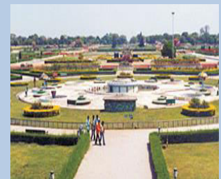
Dnyaneshwar Garden Paithan 62 Km