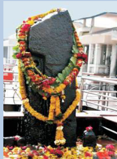
Lonar Lake ( Sarovar) - 152km